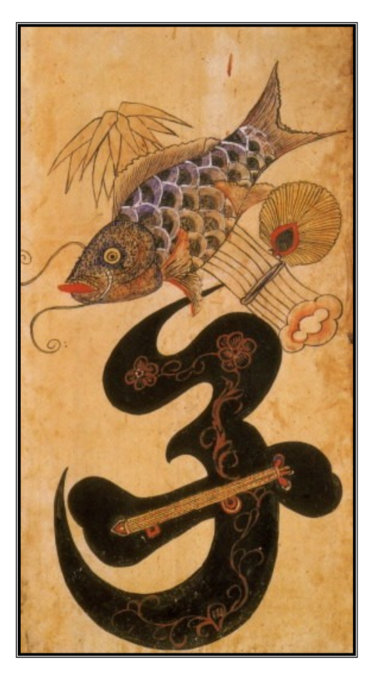
Ko (Character for "Child"), Moji-e calligraphy picture, Yi Dynasty Korea, 19th Century.